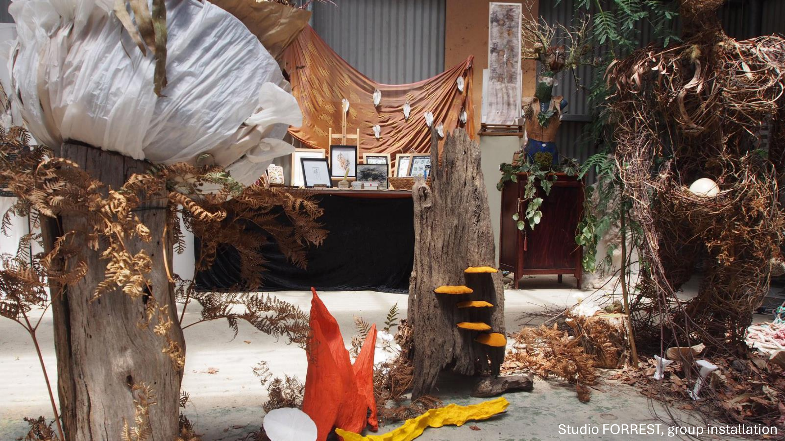
Studio FORREST, group installation