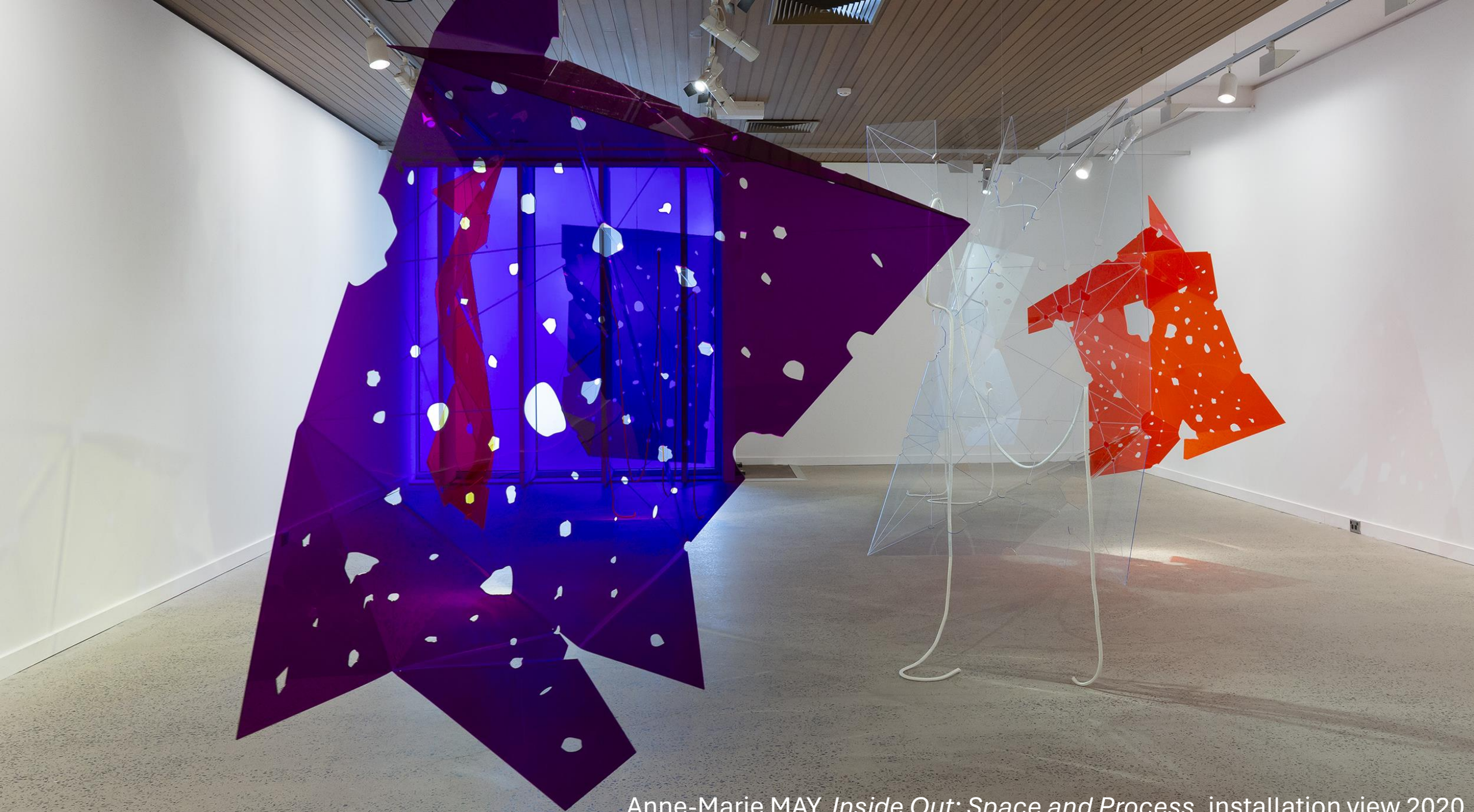
Anne-Marie MAY, Inside Out: Space and Process , installation view 2020