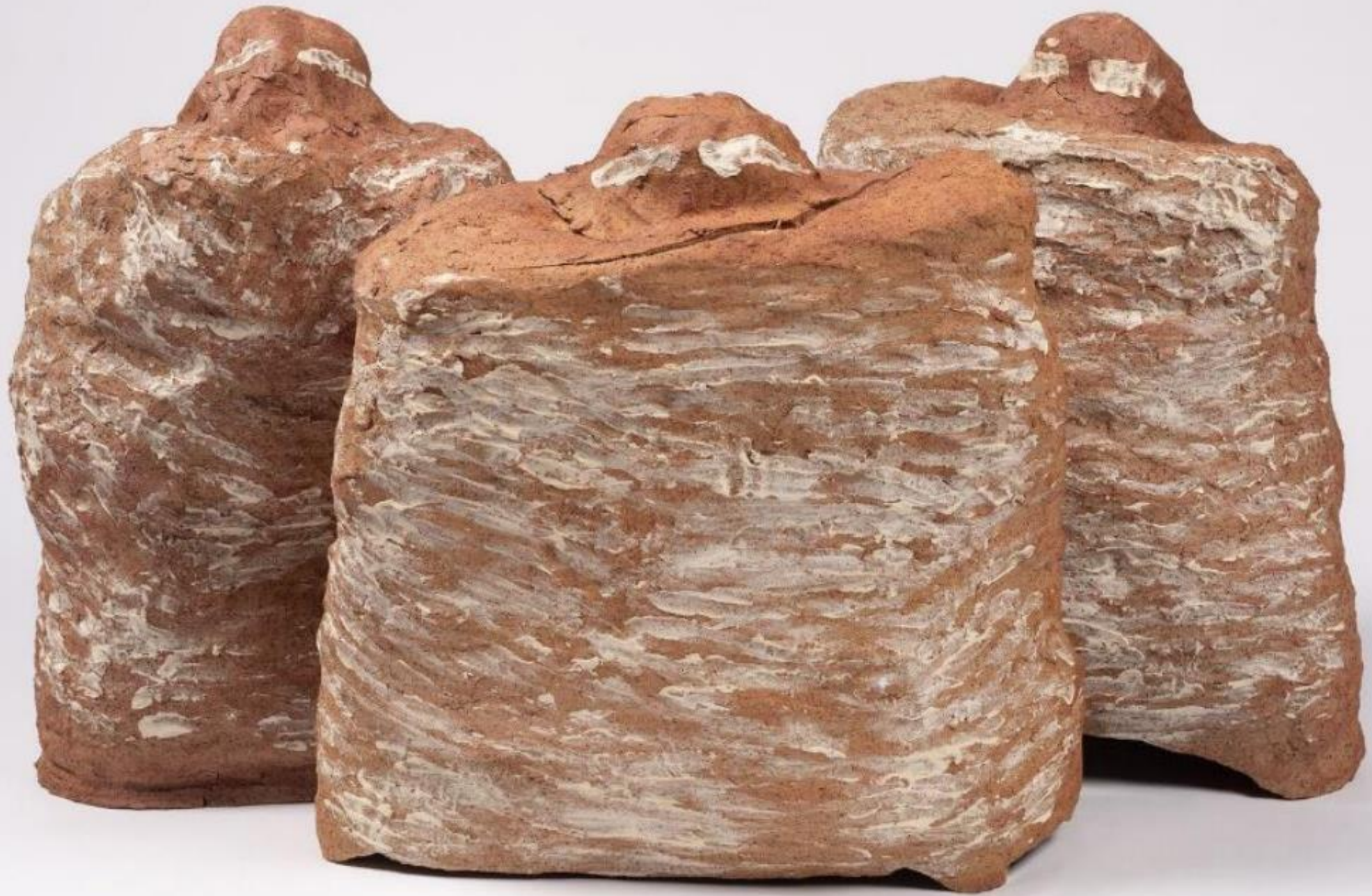
Nicholas CURRIE, Gumai Giberra (Them mob are as big as mountains) 2023